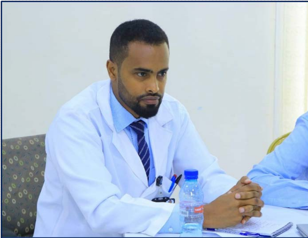
National Forensic Expert (NFE)