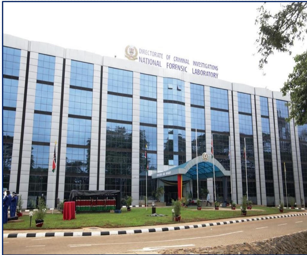
National Forensic Laboratory – DCI, Kenya